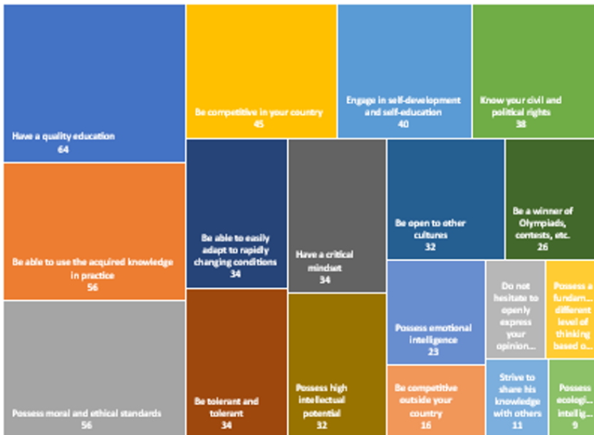
Diagram 1. Matrix of social and political characteristics of a Kazakhstani citizen as a representative of the “intellectual nation” (experts, N = 100, %, 2025)

4. The matrix of qualitative characteristics of a representative of the “intellectual nation,” as identified by experts, reflects an orientation toward the formation of a democratic-type citizen: educated, pragmatic, critically thinking, aware of his or her rights and responsibilities, oriented toward life in a competitive environment, adaptive, and socially active (Diagram 1).