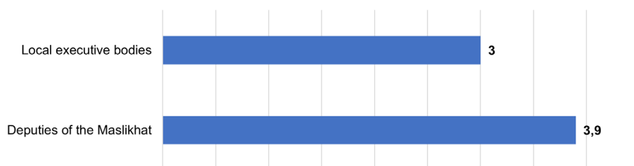
Figure 3. Assessment of Deputies' Engagement in Maslikhat Activities (on a 5-point scale)

The insufficient effectiveness of maslikhats, according to most surveyed experts, is linked to a low level of engagement in the work of the representative body (Figure 3).